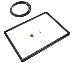
1550PF Special Application Panel Frame