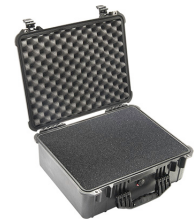
1550WF With Foam