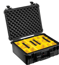
1554 With Padded Dividers