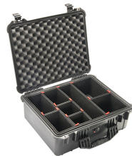
1550TP With TrekPak Divider System