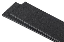
1510TPDIV Extra TrekPak Dividers