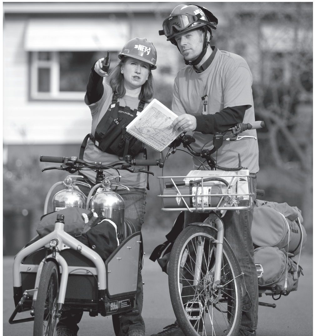
During an emergency, Logistics and Transportation ATVs coordinate bicycle transport.

The ATV program covers the full spectrum of community response with specialized roles that go far beyond basic assistance: